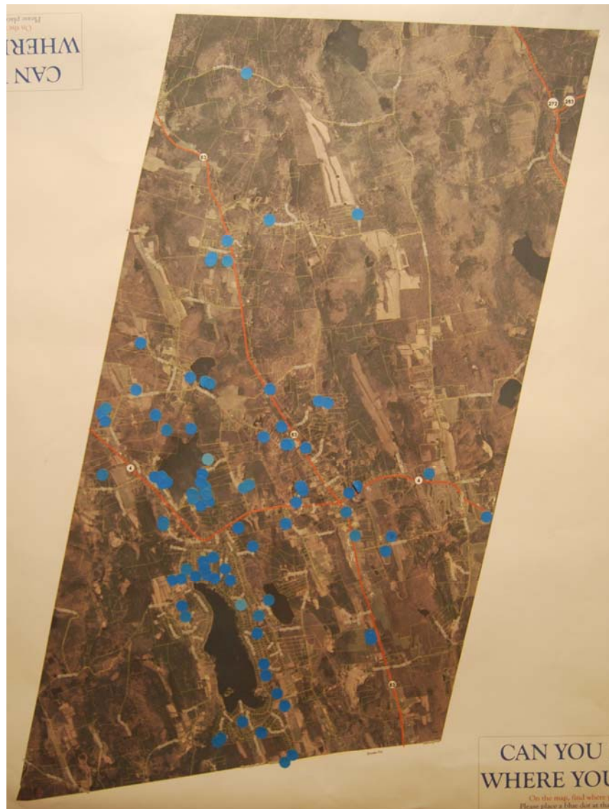
Map of Where People Lived

As a result, there did not seem to be a “geographic bias” which might have skewed the results of the meeting.