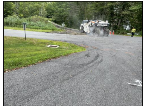
Reclaiming Pavement on West Hyerdale Dr., Canterbury Ct., and Allenby Ct.

This summer season Public Works has continued working on the road plan with the rebuilding of several sections of West Hyerdale Dr. including from Shelbourne Dr. to Canterbury Ct., from Bentley Cr. to Allenby Ct. and from #244 to Weldon Ct.; additionally we are rebuilding Canterbury Ct., and Allenby Ct. Repairs and replacement of drainage systems are also being made in other locations in Town. High demand along with high prices have made this a particular challenge. We will continue drainage projects on select roads into the fall.