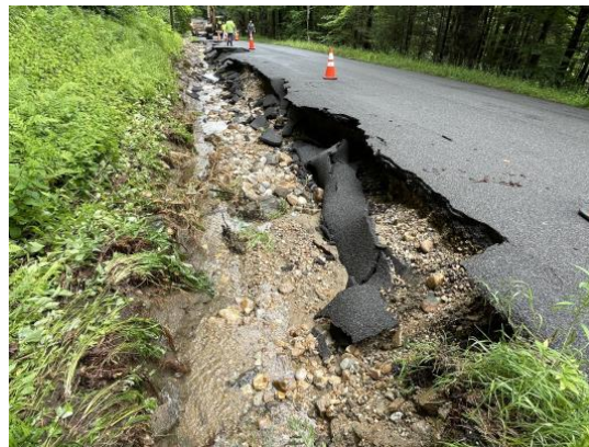
Town staff repairing storm damage from July 9 th , E. Street North

This summer season Public Works has continued working on the road plan with the rebuilding of a section of West Hyerdale Dr. from Weldon Ct. to Sutton Ct; additionally we are rebuilding Sutton Ct., and paving additional sections of roads. Repairs and replacement of drainage systems are also being made in other locations in Town. High demand along with high prices have again for a second year made this a particular challenge. We will continue drainage projects on select roads into the fall.