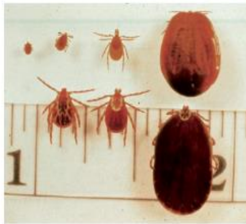
Comparison between the blacklegged tick and American dog tick (above). Top row left to right: nymph, male, female, and engorged female I. scapularis . Note engorged female is nearly as large as the engorged female American dog tick. Bottom row left to right: male, female, and engorged female D. variabilis . Note the white markings on the scutum of D. variabilis can help distinguish between the two engorged ticks.

The Connecticut Agricultural Experimentation Station