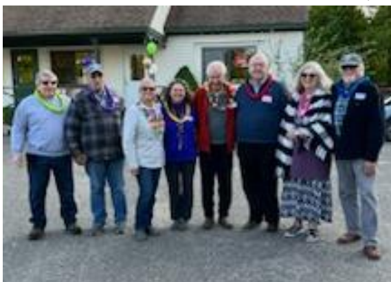
Members of Goshen Housing Trust Board at recent Second Anniversary Celebration

In April, the Connecticut Community Foundation conducted their annual GiveLocal two-day giving event for local non-profit organizations. Once again, Goshen was generous with their support of the many non-profits that make a difference in our wonderful Town.