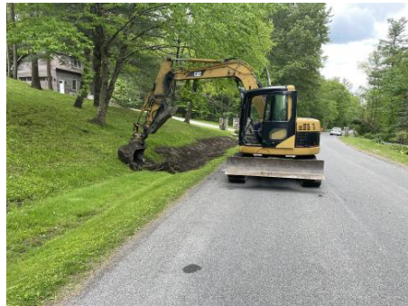
Performing Drainage Swale Maintenance on East Hyerdale Dr.

During the 2023 Summer Season, the Public Works Department will be chip sealing approximately 8 miles of road in the central area of Town. Roads slated for chip sealing have been crack sealed and areas of asphalt in poor condition have been shimmed over with a new layer of asphalt. This work is a part of the 10 year pavement management plan instituted by the Town in 2014. Public works will also be working on drainage projects on West Hyerdale Drive, Sutton Ct, and Crossman Rd. prior to the reclaiming and paving of the roads later this year. Additional smaller drainage improvement projects will be taking place on sections of roads throughout Town.